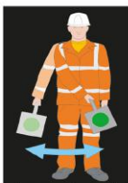
Slowly move towards the machine controller