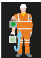
Slowly move away from the machine controller